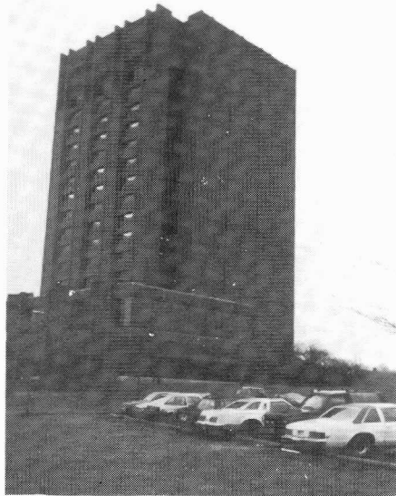
The National Agricultural Library, U.S.D.A., Agricultural Research Center, Beltsville, MD.

Conference Transportation: The R2 bus line runs every 1/2 (rush) to one hour (nonrush) between designated motels on Rt. 1 and the CAE and Brookland Metrorail Station (for forays into Washington, D.C.). Chartered buses will be provided for special conference events.