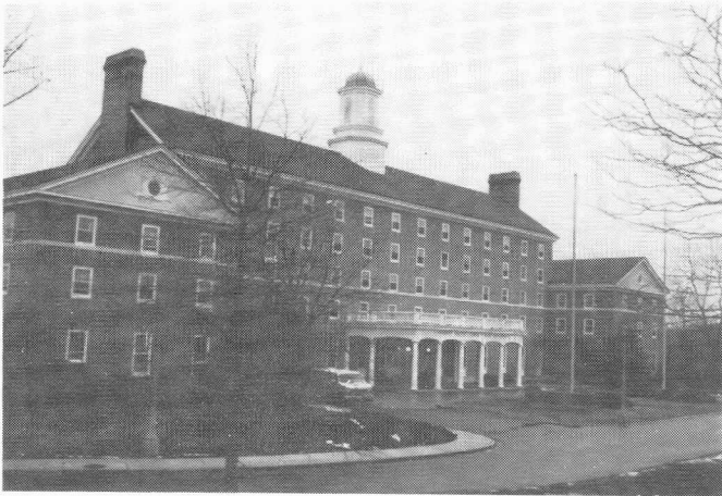
The Center of Adult Education, University of Maryland, College Park, MD. Site of the 1989 Annual Meeting of the Society for Invertebrate Pathology.

The annual meeting of the Society for Invertebrate Pathology will be held at the Center of Adult Education on the campus of the University of Maryland at College Park, Maryland. The organizing committee has put together a program which they think will be of interest to all members of the society. Some new features include a session on biological assays and workshops on neoplasias, and protein and nucleic acid separation. In addition to attending the symposia and other presentations, one should take advantage, while in the Washington, D.C. area, of the many aspects of our past history and present government in this part of the U.S.A. and plan to spend some extra time visiting museums, monuments and various government agencies. (You might make an appointment to have a person-to-person interview at your favorite granting institution.)